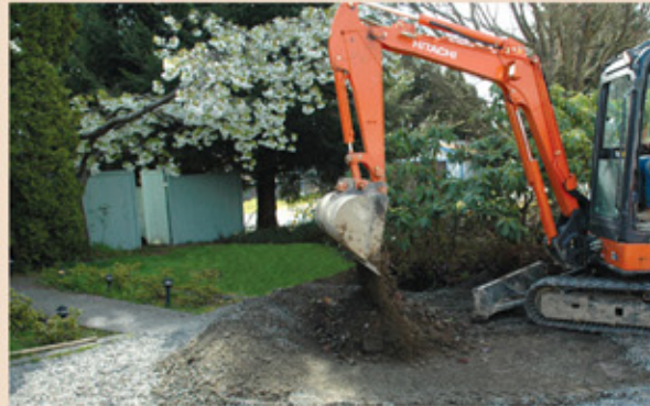
Dig a small hole