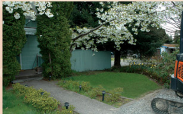
Finish and clean up